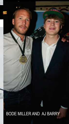
BODE MILLER AND AJ BARRY

Consider our Summit Club for added benefits! Please make a gift at the highest comfortable level. Donations are tax-deductible to the extent allowed by law.