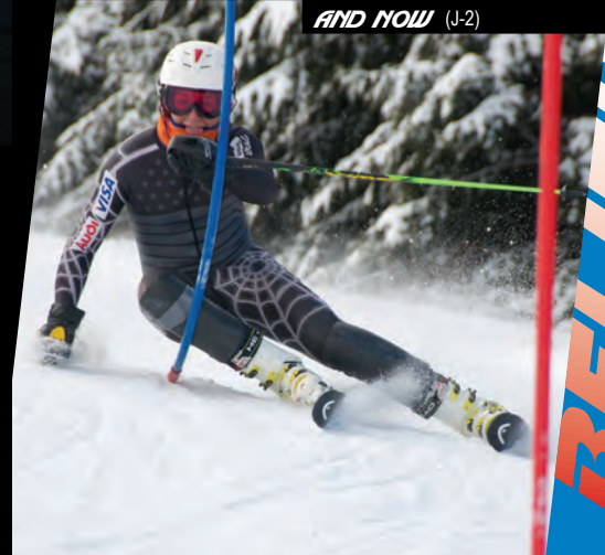
AND NOW (J-2)